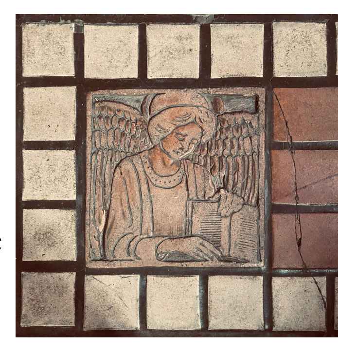
Detail, Chancel tile floor, symbol of Saint Matthew

It is not only in the windows that the beautiful craftsmanship and detail may be found. The chancel area, for example, is paved with exquisite tile by Ernest Batchelder, the preeminent tile maker in Southern California at the time of Trinity's construction in the 1910s. The carved furniture, oak pulpit, and limestone font were created by