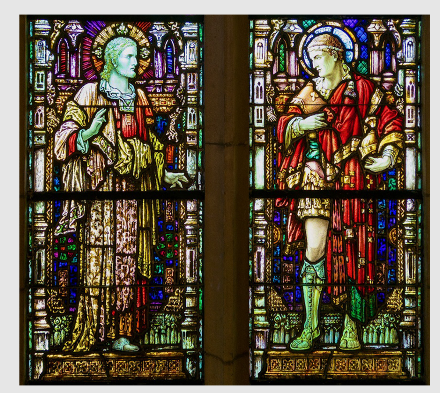
Detail, West window 2, Nobleman's Appeal to Christ for his Son

Certain sanctuary windows merit special attention. The Nobleman's Appeal to Christ for his Son, the westfacing window at the end of the north aisle, stands apart from the others because it was fabricated by a craftsman who had been an associate of the famed Tiffany Studios. The window, installed in 1927, has the decorative elements and opalescent characteristics of Tiffany Glass.